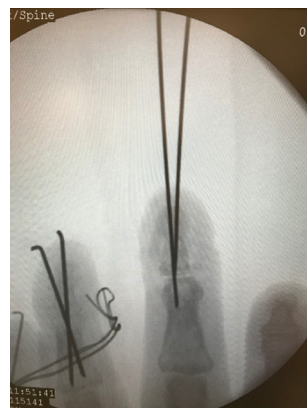
Figure 4. At 7 weeks after the first operation, an arthrodesis with an olecranon graft was performed on the 3rd distal interphalangeal joint