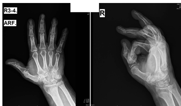
Figure 6. Six months after the olecranon bone grafting, the bony healing was complete

in nonunion in the 3rd finger, as confirmed by x-rays taken in the 6th week [Figure 3]. At 7 weeks after the first operation, an arthrodesis with an olecranon graft was performed on the 3rd distal interphalangeal joint [Figure 4]. The thickness and stability of the nail bed were suitable, so grafting was performed through the incision in the middle of the nail bed [Figure 5]. Six months after the olecranon bone grafting, the bony healing was complete [Figure 6].