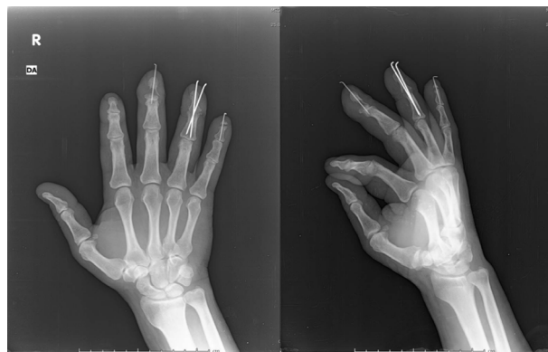
Figure 3. Segmental bone defect can be seen in the distal phalanx of the third finger